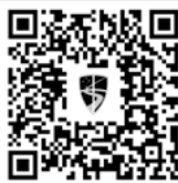
Setting up TransportMe™ App