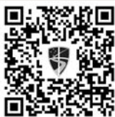
Instrumental Music Program sign up