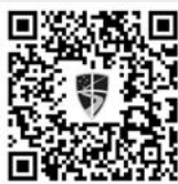
Setting up your SEQTA Engage