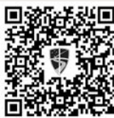
Setting up your Parent Lounge