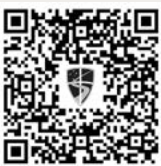
Setting up your Kennedy App