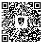
Devices (BYOD) and Induction Booking